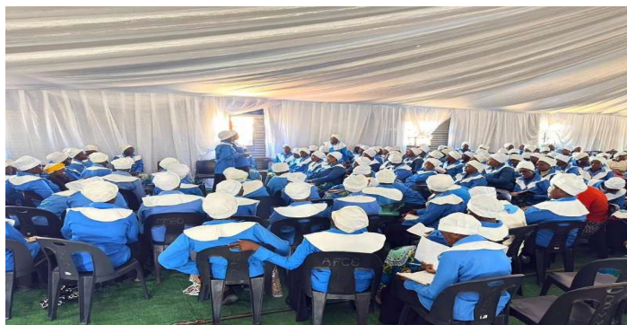
Women's Fellowship Engagement during a break at the Passover Conference in Saueyemwa, Rundu, Namibia

And the Lord Jesus gives a command in Matthew 28:18-20 as He spoke to the disciples on the Mount of Olives in Jerusalem, saying, "All authority has been given to Me in heaven and on earth. Go therefore and make disciples of all the nations, baptising them in the name of the Father and of the Son and of the Holy Spirit, teaching them to observe all things that I have commanded you; and lo, I am with you always, even to the end of the age."